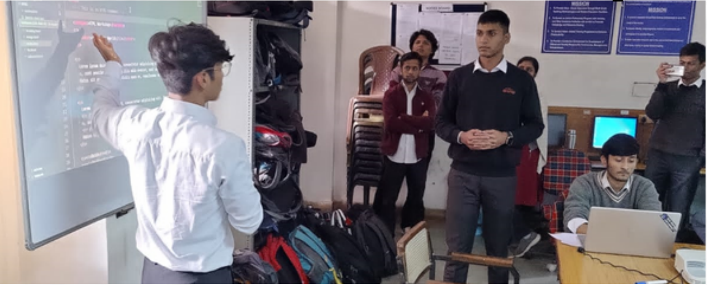
Technical education is the backbone of our society.