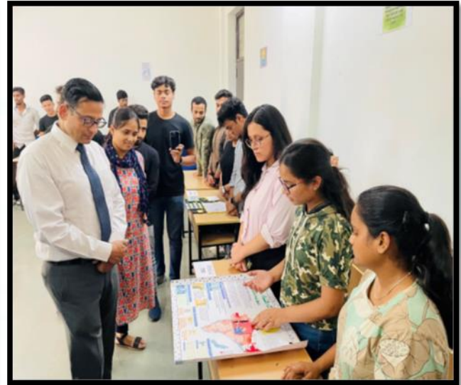
Glimpse of Event