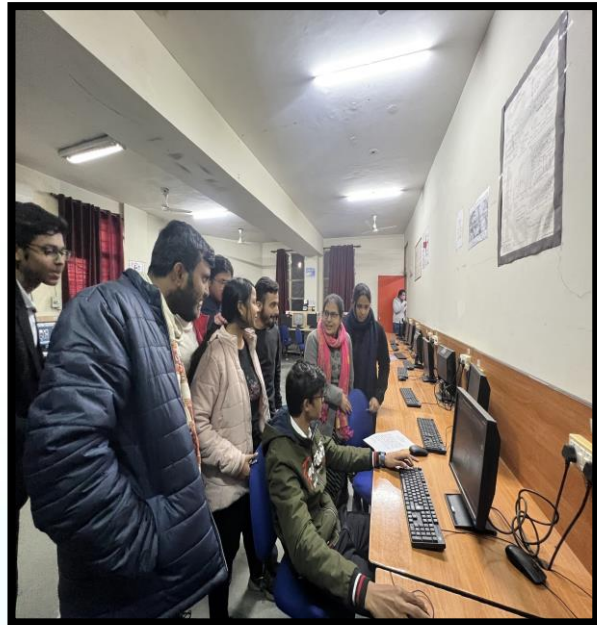
Glimpse of Event