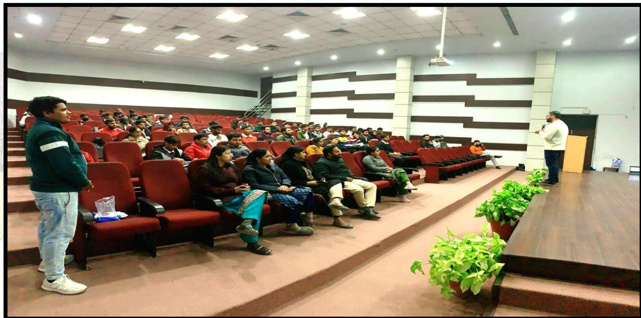
Faculty Members and students of, Department of Civil Engineering, ADGITM during the session