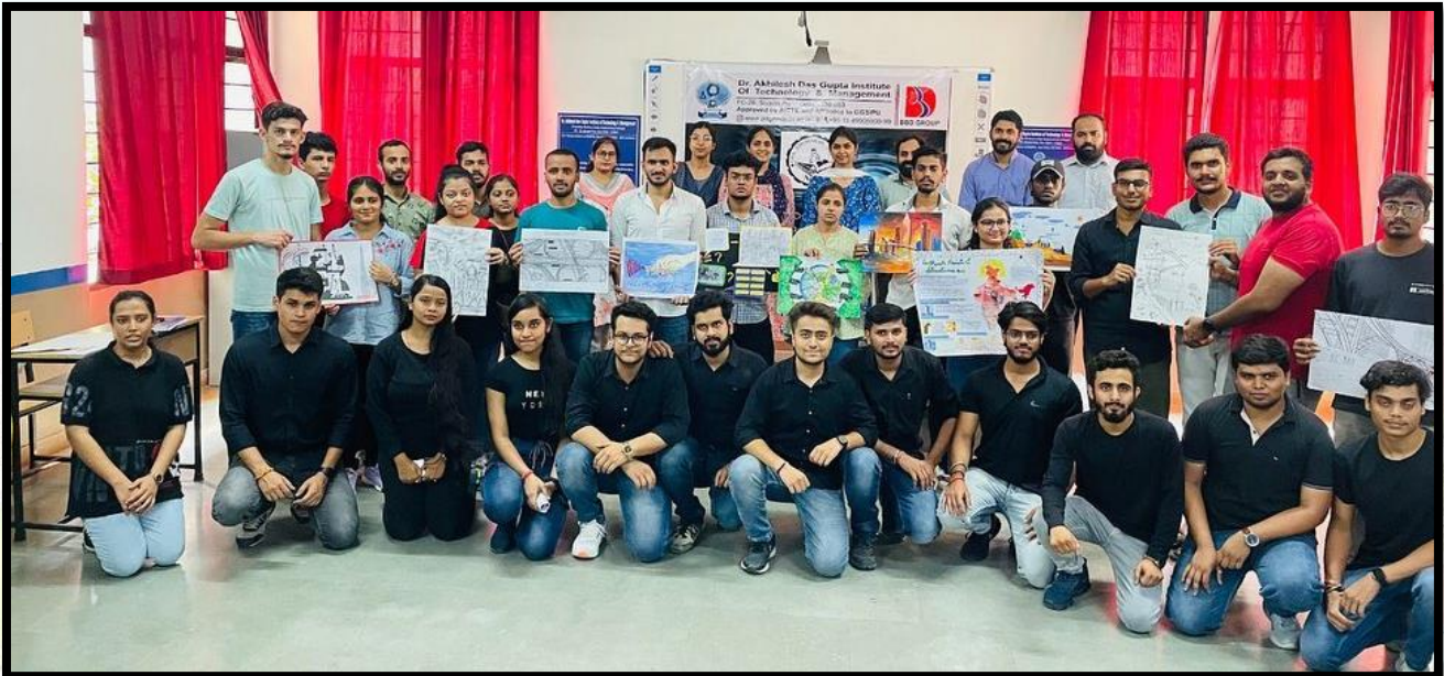
No of Participants in Aakaar Event, Students of Civil Engineering Department