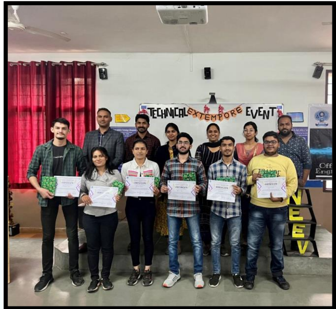
Glimpse of Event