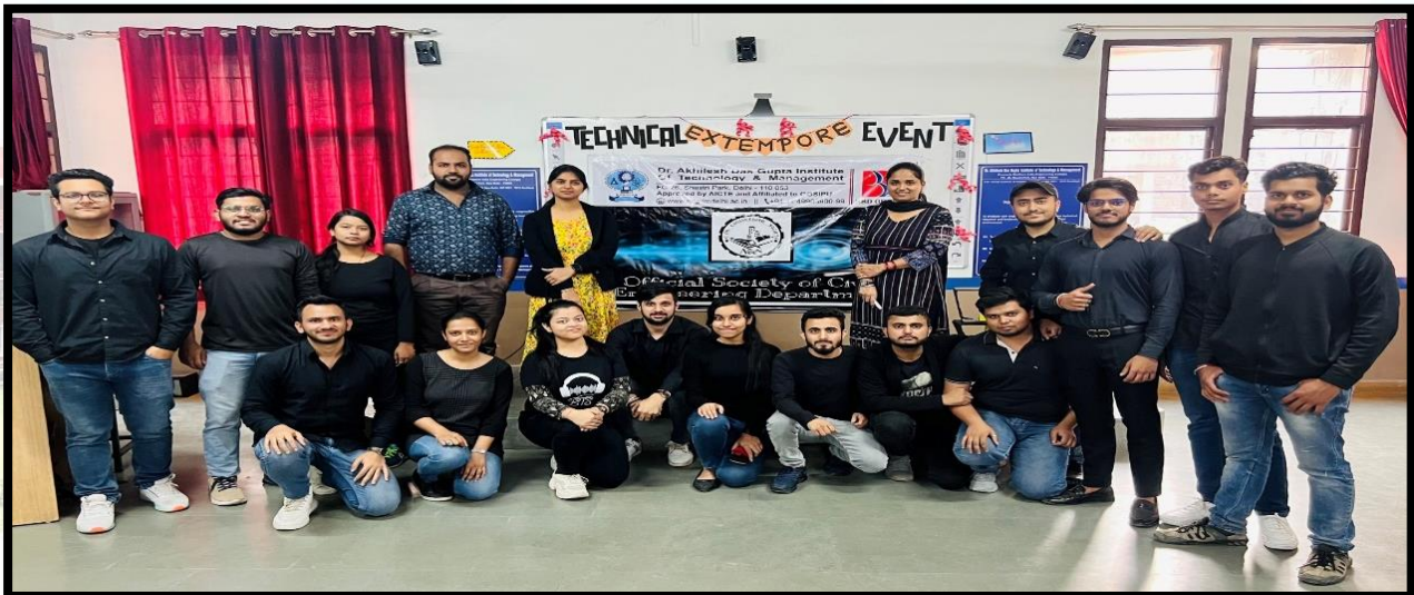
No of Participants in Technical Extempore Event, Students of Civil Engineering Department