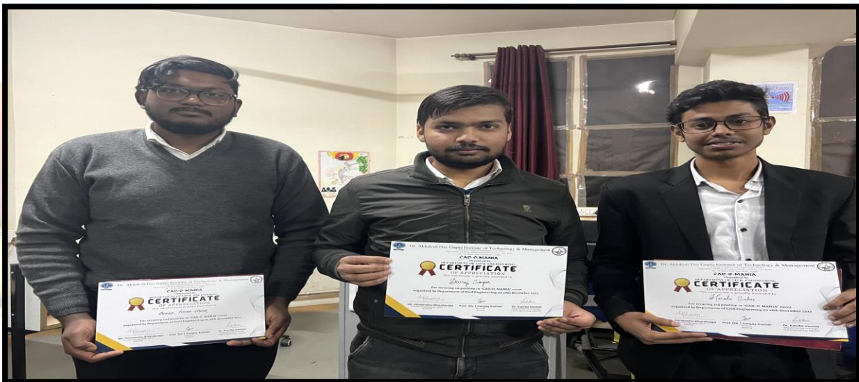
Winner and runner up students of, Department of Civil Engineering, ADGITM