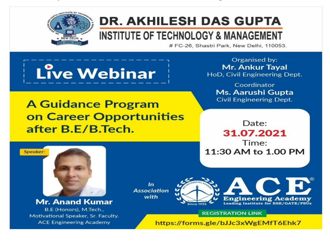
Poster of Webinar on Career Opportunities by ACE Engineering Academy

Beneficiaries: Faculty members and students from various Departments, ADGITM